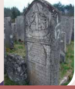
The ancient cemetery in Brody

Amen and Brachos in the Teachings of a Baal Hayahrtzeit